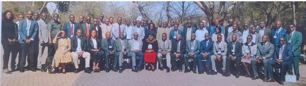
Participants at 8 th International Conference on Sustainable Transportation, June 26 th – 28 th , 2023 at Avani, Livingstone, Zambia, Africa

Everyone in any way connected with transportation is invited. This professional networking group will be of interest to funding agencies, national government authorities, parastatals, policy and decision-makers, academics, researchers, students, and professionals active in the planning, construction, maintenance, logistics, operation and safety of passenger and freight transport, road traffic, rail, maritime and aviation. End-users will also find the group of interest.