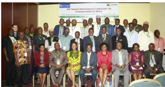
Participants at ICTA2017 in Abuja, Nigeria, Africa