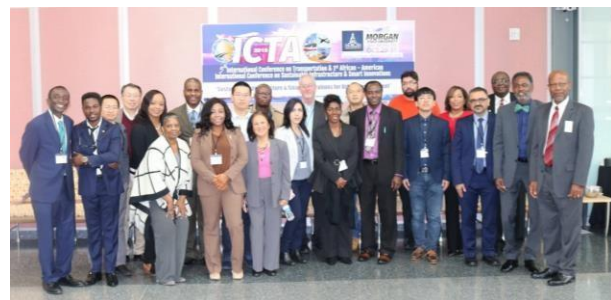
Participants at ICTA2019 in Baltimore, MD, USA

4.2 The International Road Federation (IRF) Geneva is a non-governmental, non-profit organization with the mission to encourage and promote development and maintenance of better, safer and more sustainable roads and road networks. Working together with its members and associates, the IRF promotes social and economic benefits that flow from well-planned and environmentally sound road transport networks. It helps put in place technological solutions and management practices that provide maximum economic and social returns from national road investments. The IRF has a major role to play in all aspects of road policy and development worldwide. For governments and financial institutions, the IRF provides a wide base of expertise for planning road development strategy and policy.